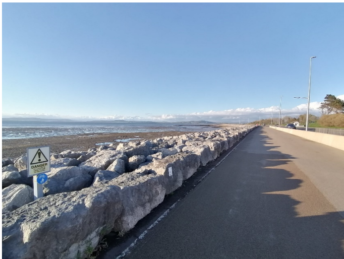
A small selection of photo's taken by the scouts during the first lockdown