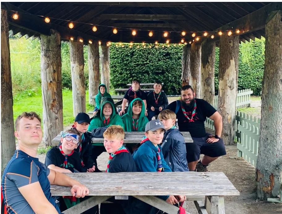
Scout Section Summer Camp 2021 - Brockholes