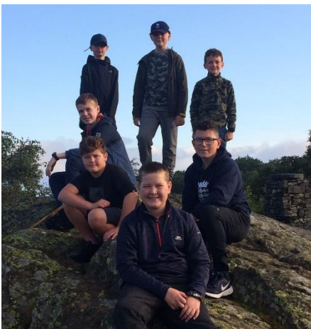
Scouts - 16th Morecambe & Heysham